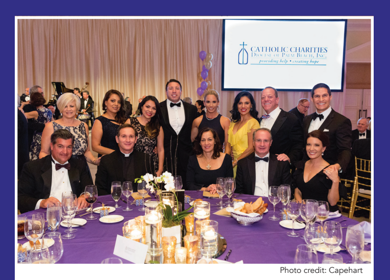
8TH ANNUAL CARITAS DEI BISHOP'S GALA JANUARY 23, 2019