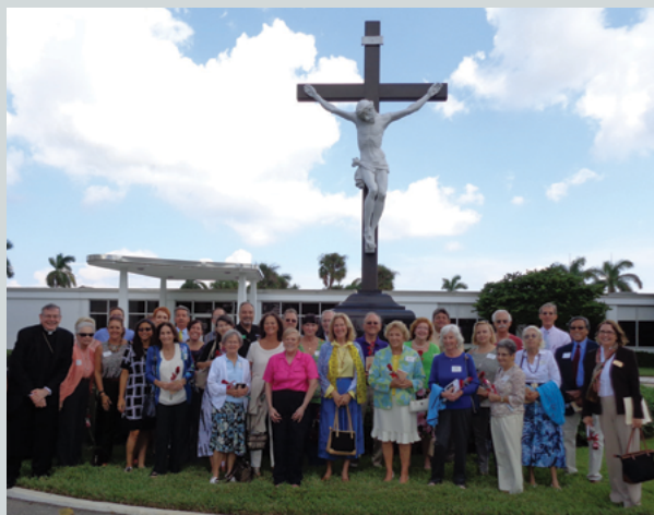
Volunteer Retreat 2015