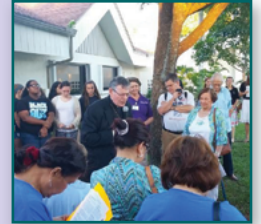
Participants at Birthline/Lifeline's Walk-a-Thon

Birthline/Lifeline 8th Annual Walk-a-Thon and Praise and Worship Night $12,838